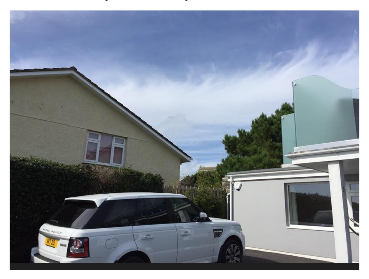
Image four: application site and proximity to the gable of no.18 Meadcombe Road

4.4 Image four helpfully demonstrates that due to the layout of the streetscene, the side of no.18, terminates where the extension begins which significantly reduces any concerns of loss of light to the first floor gable window.