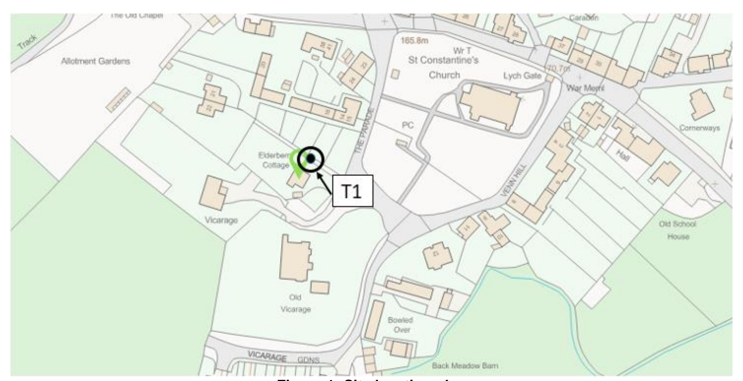
Figure 1: Site location plan

Site assessed by : L Marshall Date : 02/01/2020