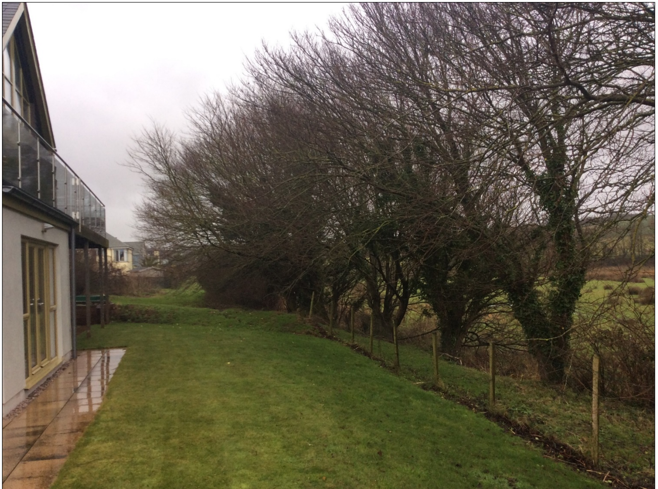
Figure 2: Northern aspect of trees over lawn